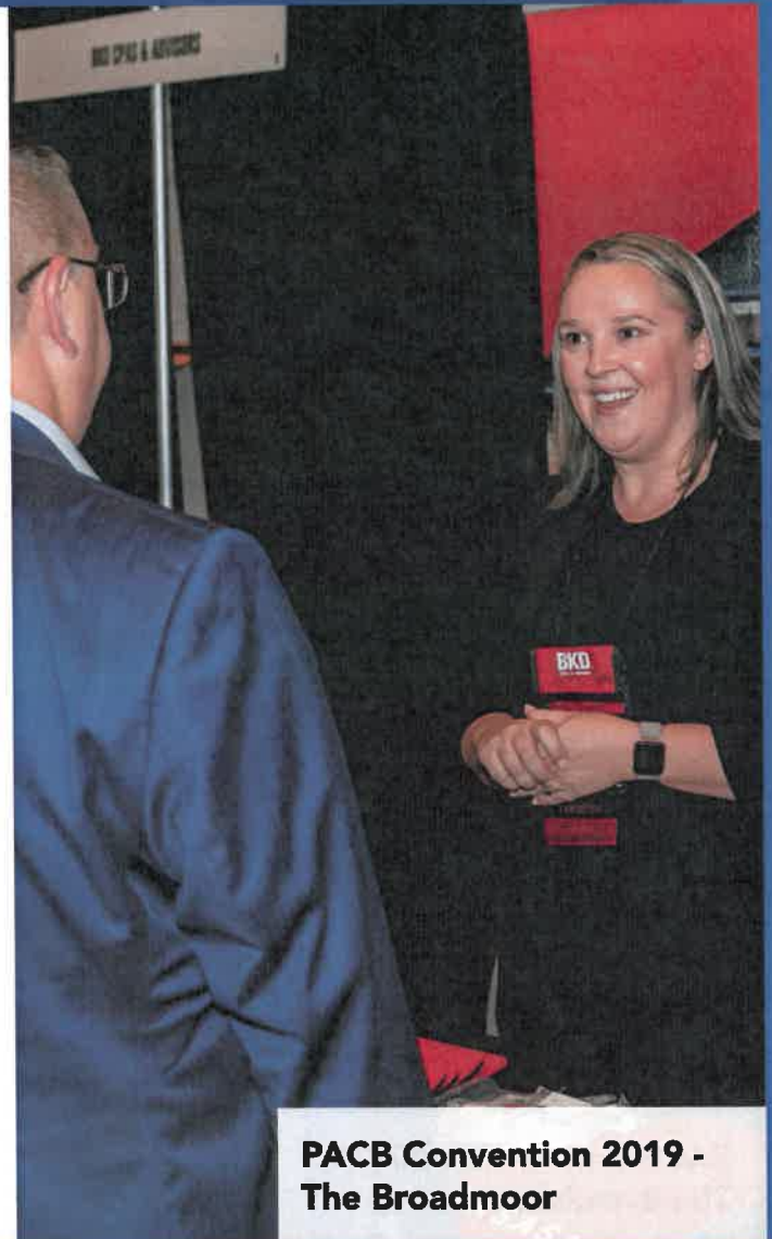
PACB Convention 2019 - The Broadmoor