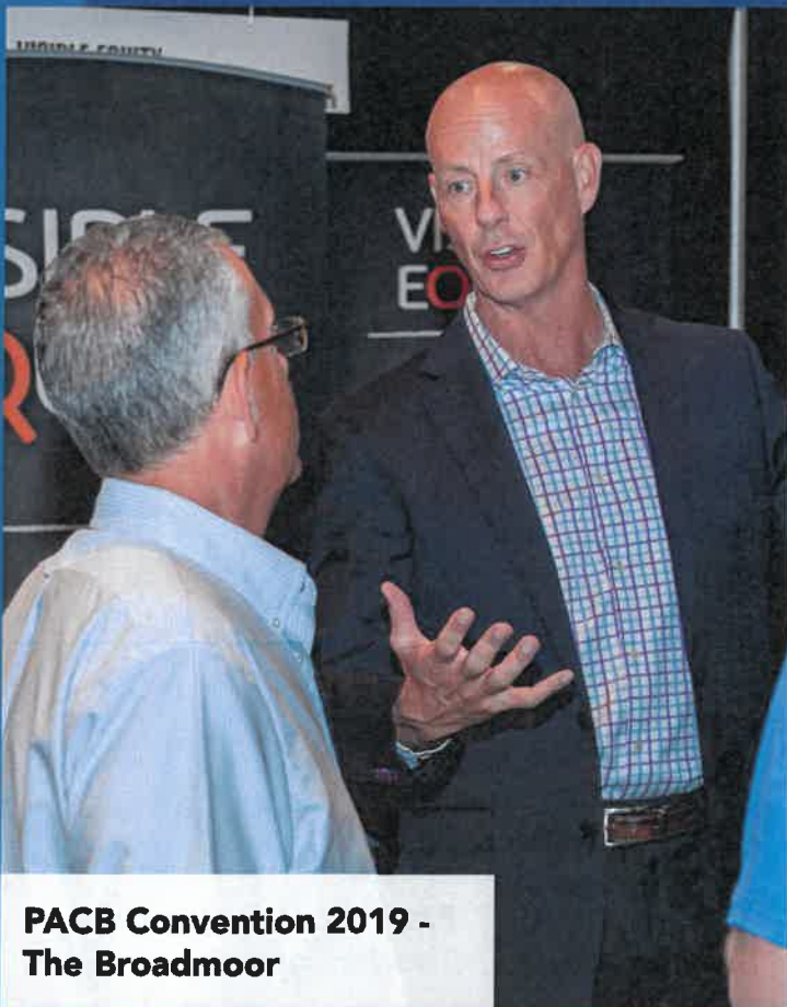
PACB Convention 2019 - The Broadmoor