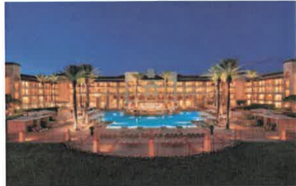
Above: Fairmont Scottsdale Princess

We encourage you to make room reservations immediately to ensure you receive PACB's block room rate. To make reservations, please call the Fairmont